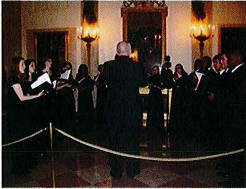
Performance at the White House - December 2013

LISTEN to A Cappella Ensemble How to Audition