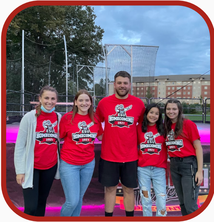
2021 ESU Homecoming