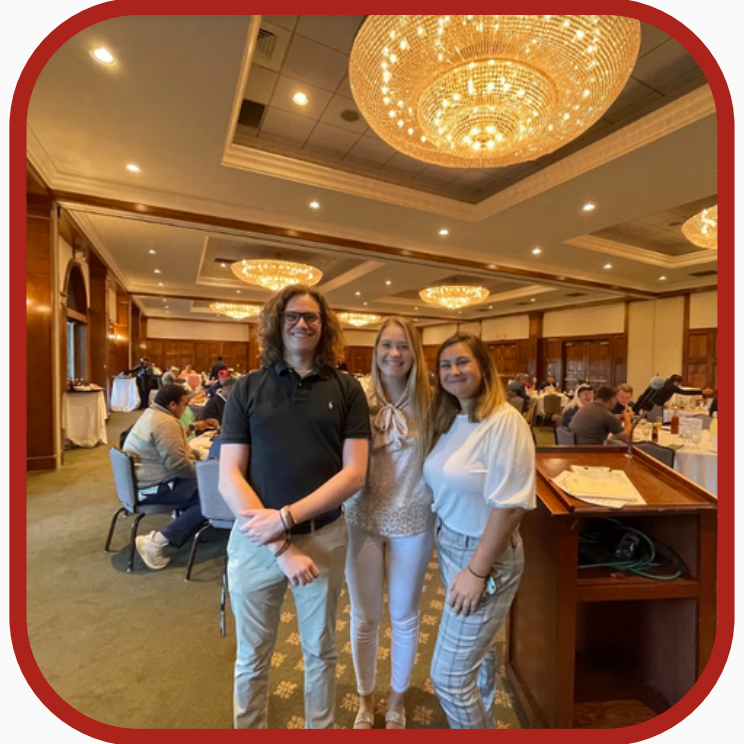
College of Business and Management Golf Fundraising Event