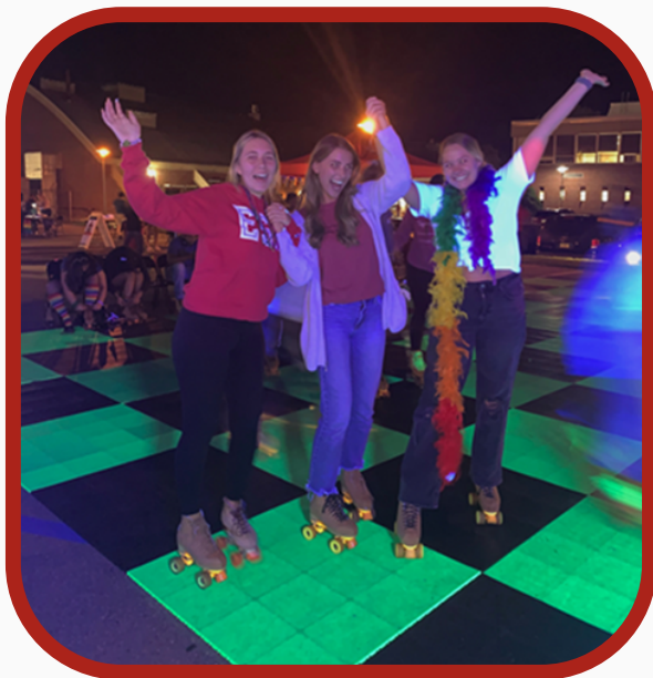
ESU Pride Rally

Students in our event planning courses have been exposed to necessary event planning skills such as: designing the meeting experience, strategic planning, site, and venue selection, negotiating contracts, budgeting, and marketing the meeting. Students have also helped plan departmental and campus-wide events as well as completed professional events and meeting planning internships in resort and convention centers.