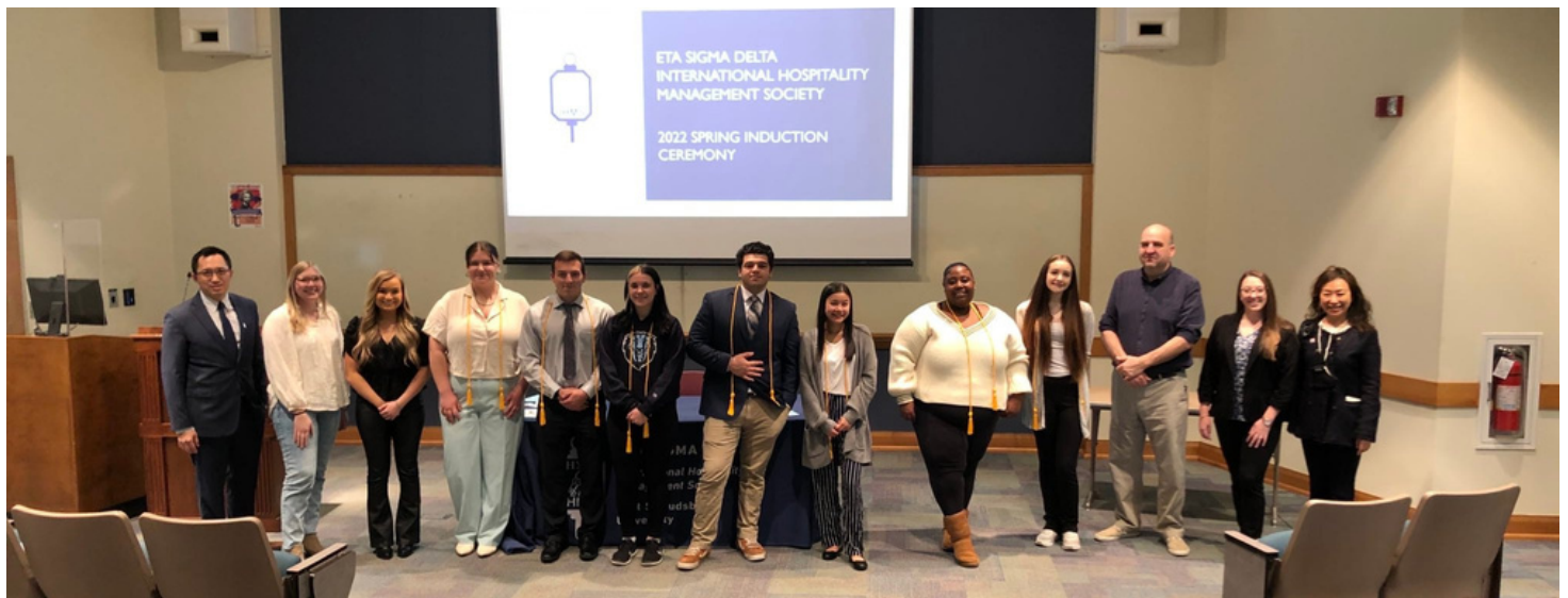
ESD Induction Ceremony