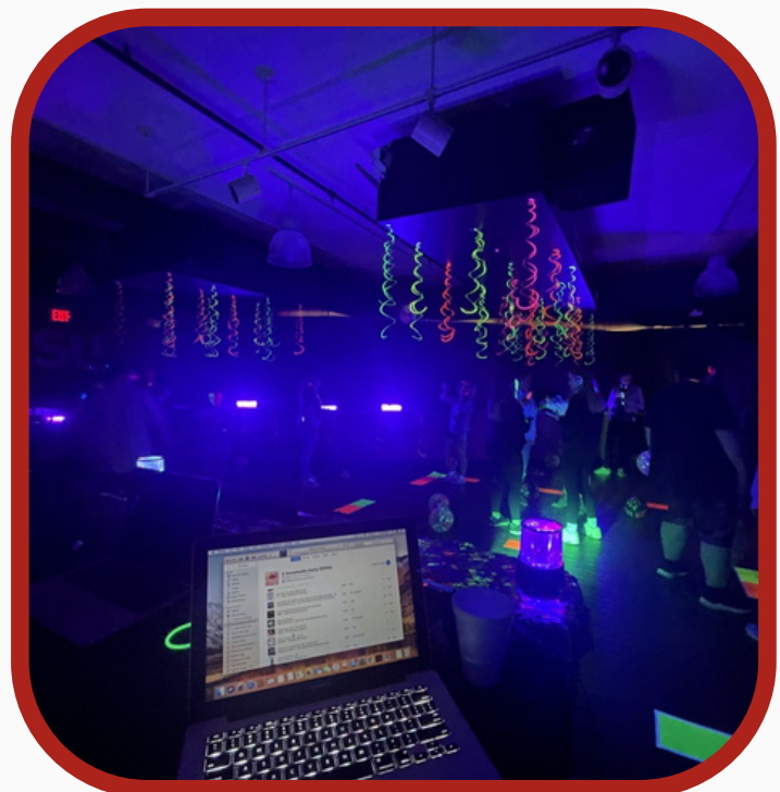
Vibes from Let's Glow Crazy