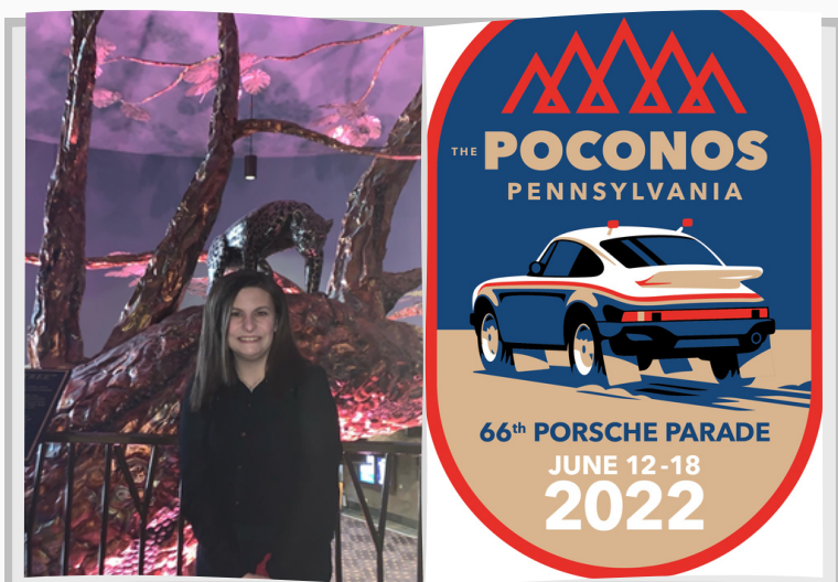
66th Porsche Parade Kalahari Resorts