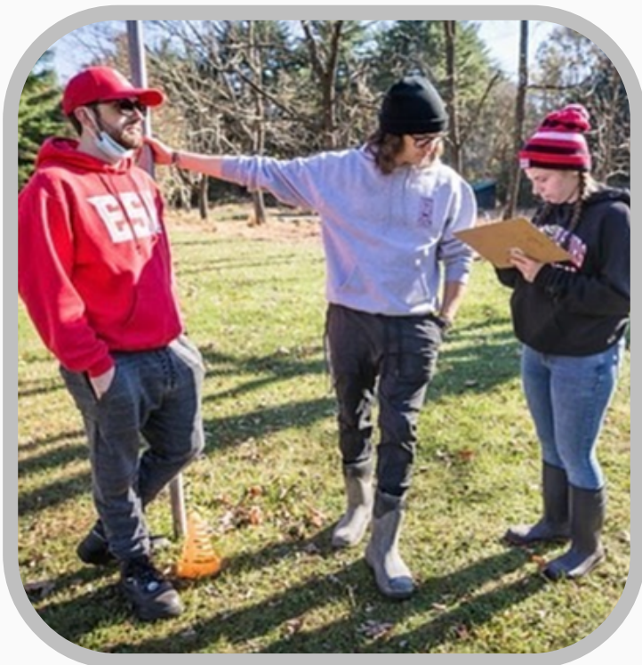
Stony Acres Challenge